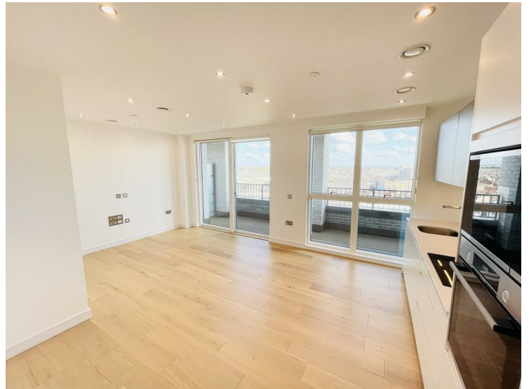
RECEPTION ROOM VIEW